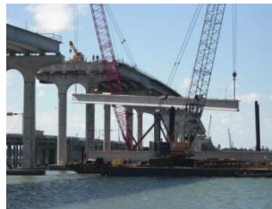
Dual Crane Pick on Water