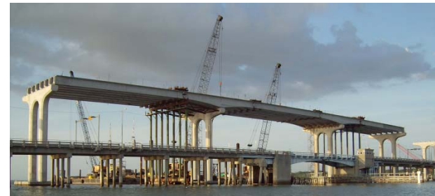
Drop in Beam Sections