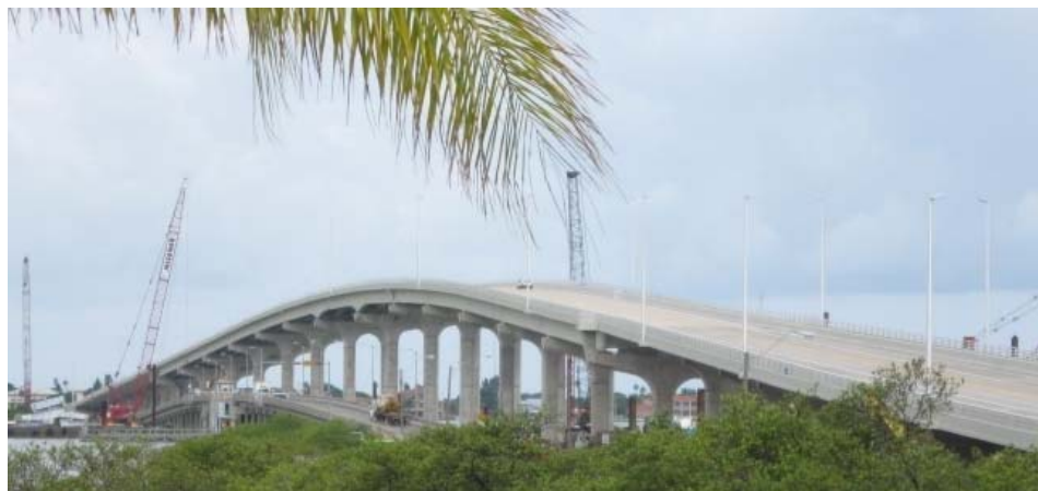
Open to Traffic