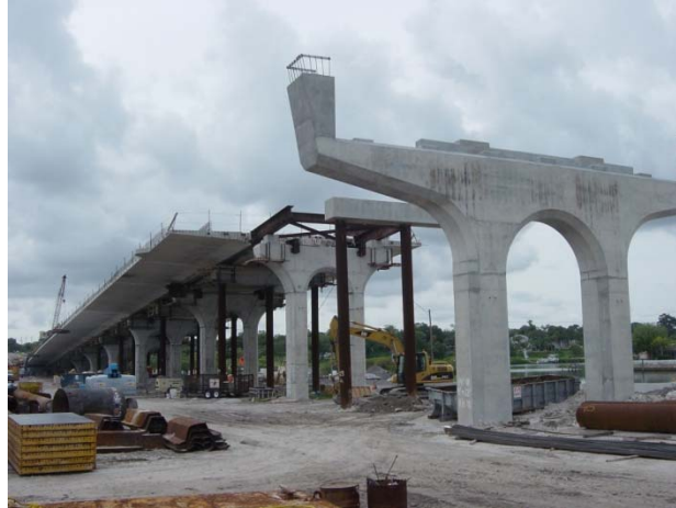
Launching the Deck